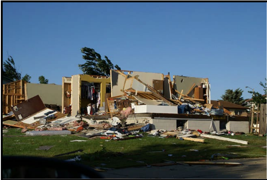
Dickinson Tornado - 2008