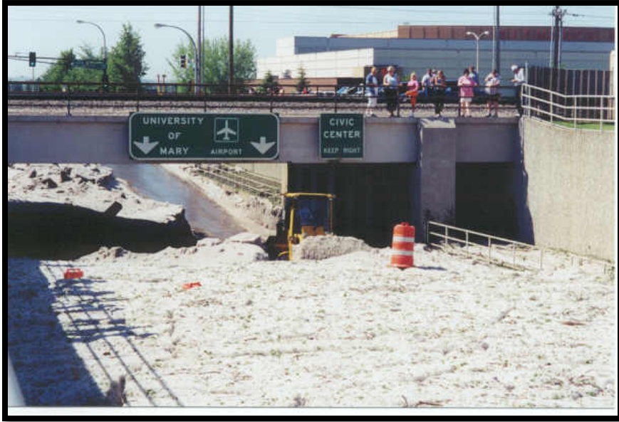
Bismarck Hail Storm - 2001