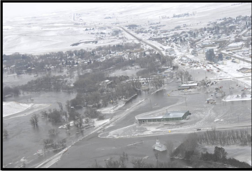
Linton Flood - 2009