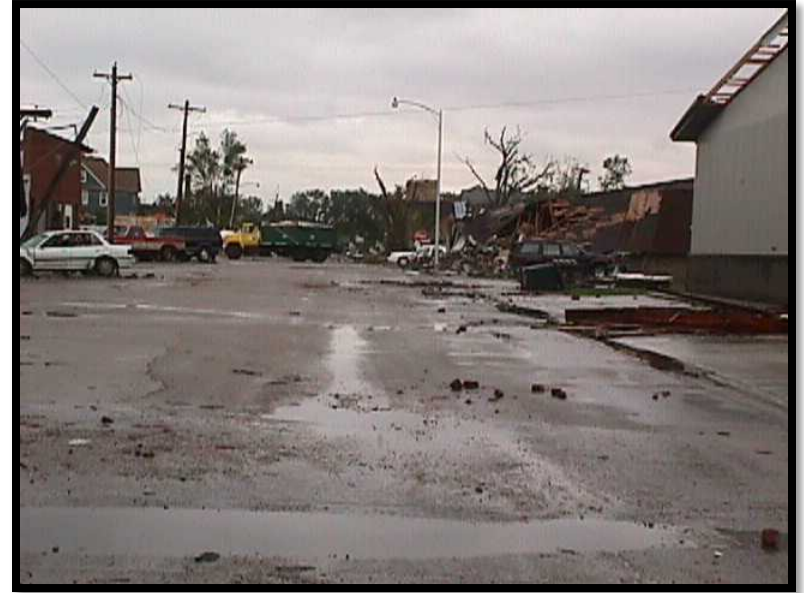
Northwood Tornado - 2007